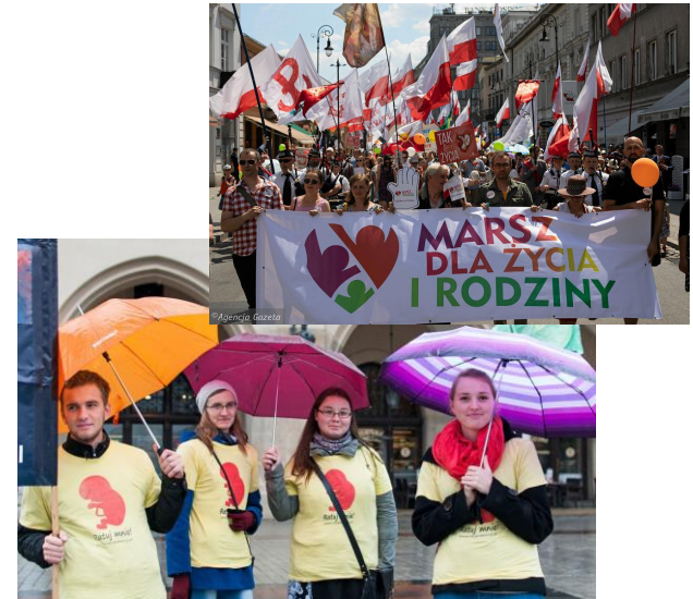
Conservative Civil Society